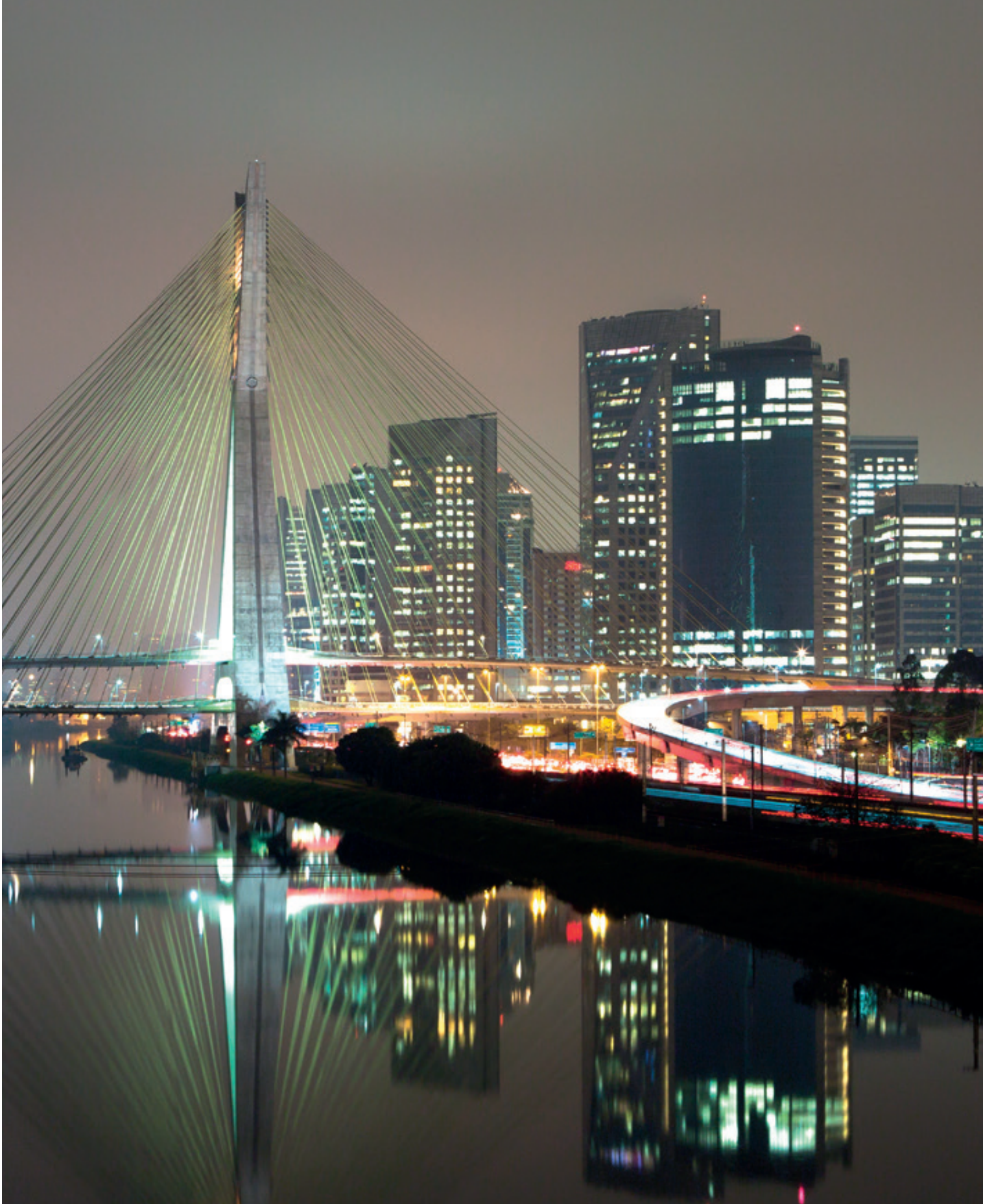
We transport the electricity that supplies the city of Sao Paulo (Brazil)

In Brazil, jointly with the Spanish company Red Eléctrica Internacional, we initiated the process of acquiring 100%, in equal shares, of the Brazilian company Energia Empreendimentos e Participações S.A. (Argo).