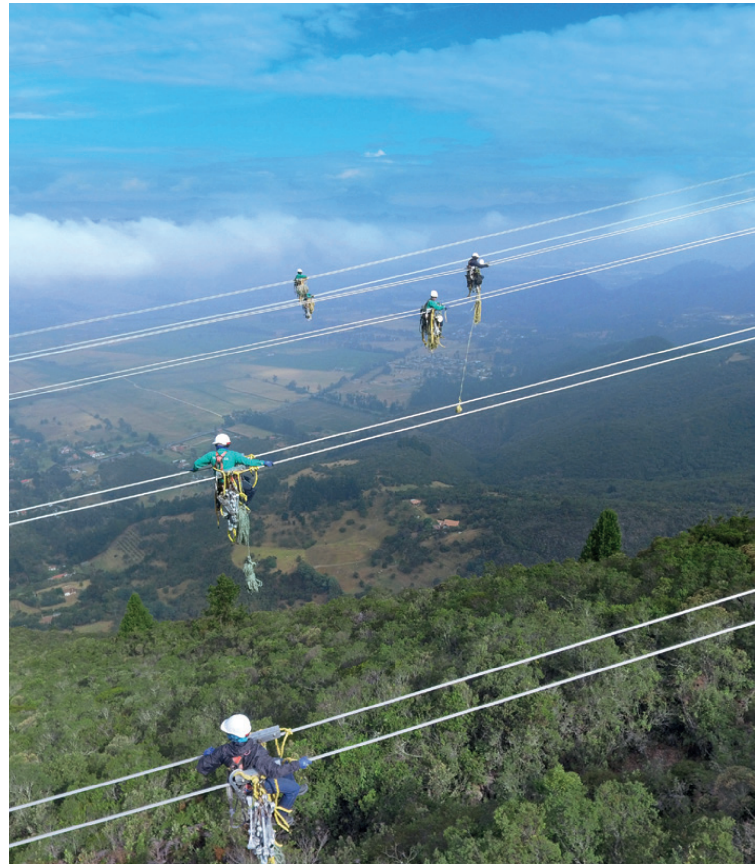
Maintenance work on our transmission lines at Guavio-Circo in Guasca, Cundinamarca

We will incorporate innovation and new technologies in our Energy Transformation.