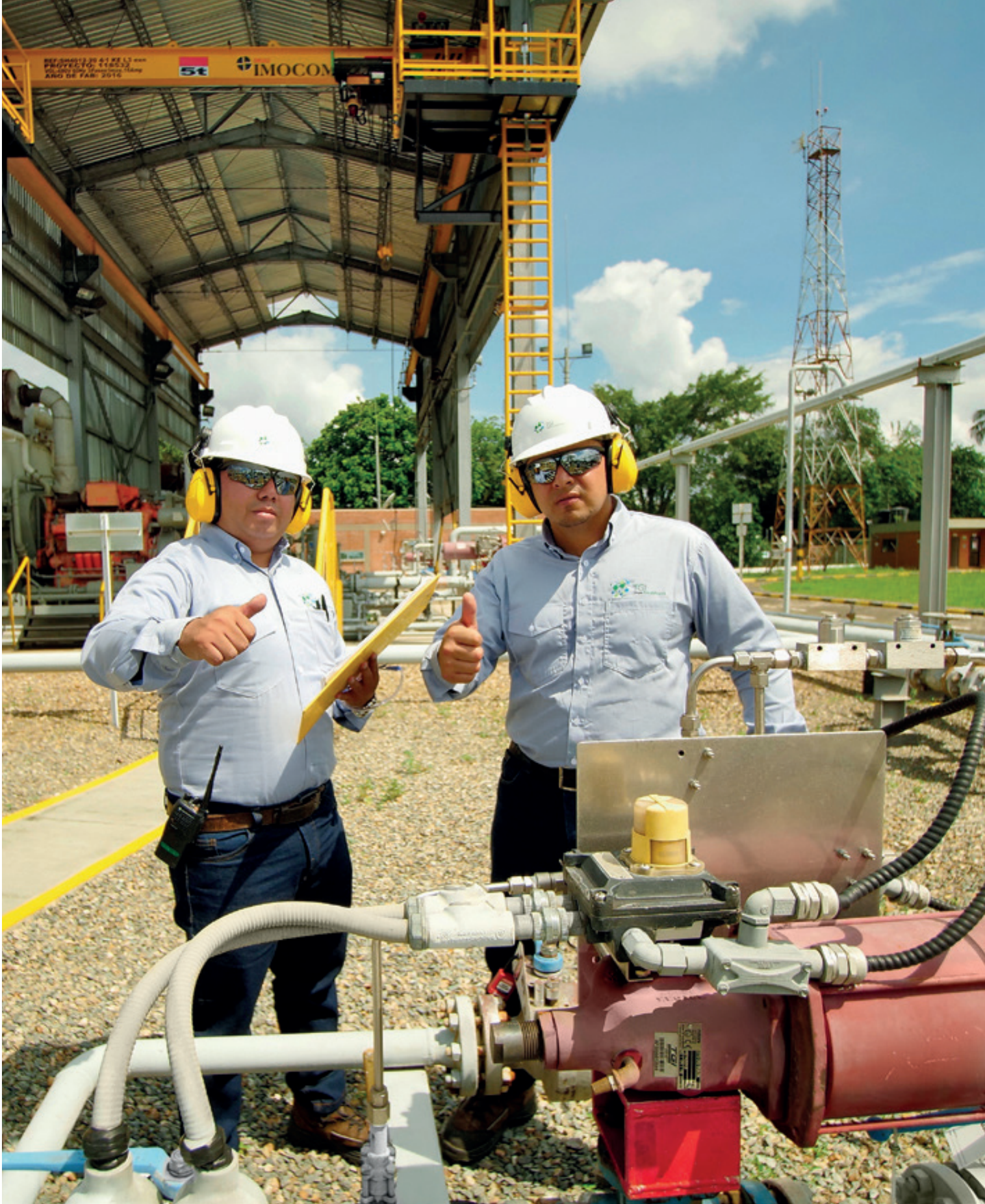
TGI employees at the Mariquita (Tolima) compression station

We will continue to strengthen the Corporate Governance Mod-el, in line with Grupo Energía Bogotá.